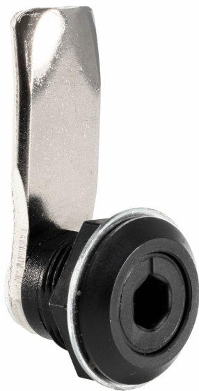
Dimensiones del orificio